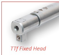
TTf Fixed Head