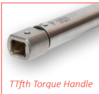
TTfth Torque Handle