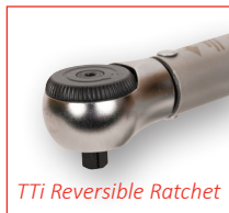
TTi Reversible Ratchet